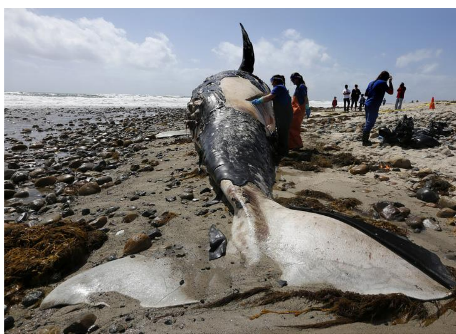
Thirty-one dead gray whales have been spotted along the West Coast since

May 3, 2019 at 12:05 pm Updated May 3, 2019 at 3:42 pm